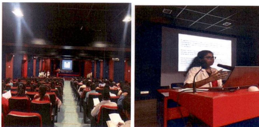
Students from Bhaskara Medical College speaking on Breast Cancer Awareness